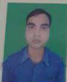
Photo of Applicant